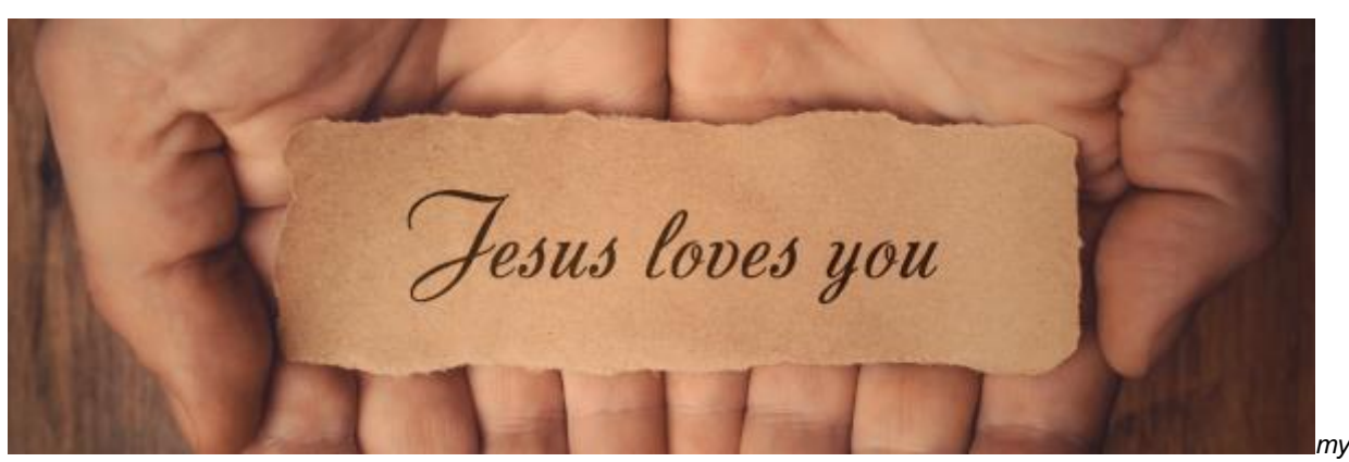
flesh longeth for thee in a dry and thirsty land, where no water is; To see thy power and thy glory, so as I have seen thee in the sanctuary. Because thy lovingkindness is better than life, my lips shall praise thee. Thus, will I bless thee while I live: I will lift up my hands in thy name" (Psalm 64:1-4).